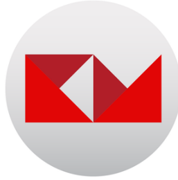
Kay Meek Arts Centre