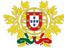
Consulate General of Portugal