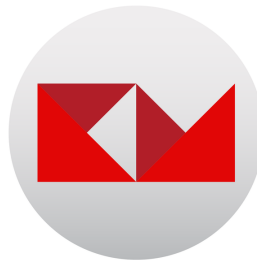
Kay Meek Arts Centre