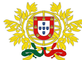
Consulate General of Portugal