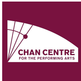
UBC Chan Centre for the Performing Arts

Portugal in Vancouver has worked with a number of different groups and businesses such as the ones identified below to promote events, contests, giveaways, reviews and more. If you want to work together to promote an event, product, or an idea, please feel free to reach out directly.